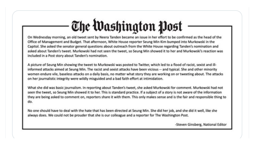
Figure 2: A statement released by The Washington Post in February 2021 in support of White House correspondent Seung Min Kim, who received racist abuse online for what the Post said was practising "basic journalism".<sup>7</sup>