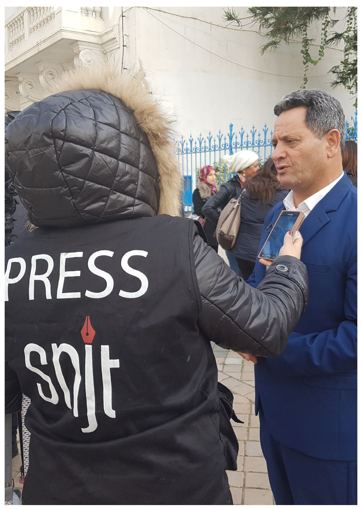
Day of anger, journalists protest in front of the Tunisian Journalist Union because of increased pressure on journalists by the police/security forces