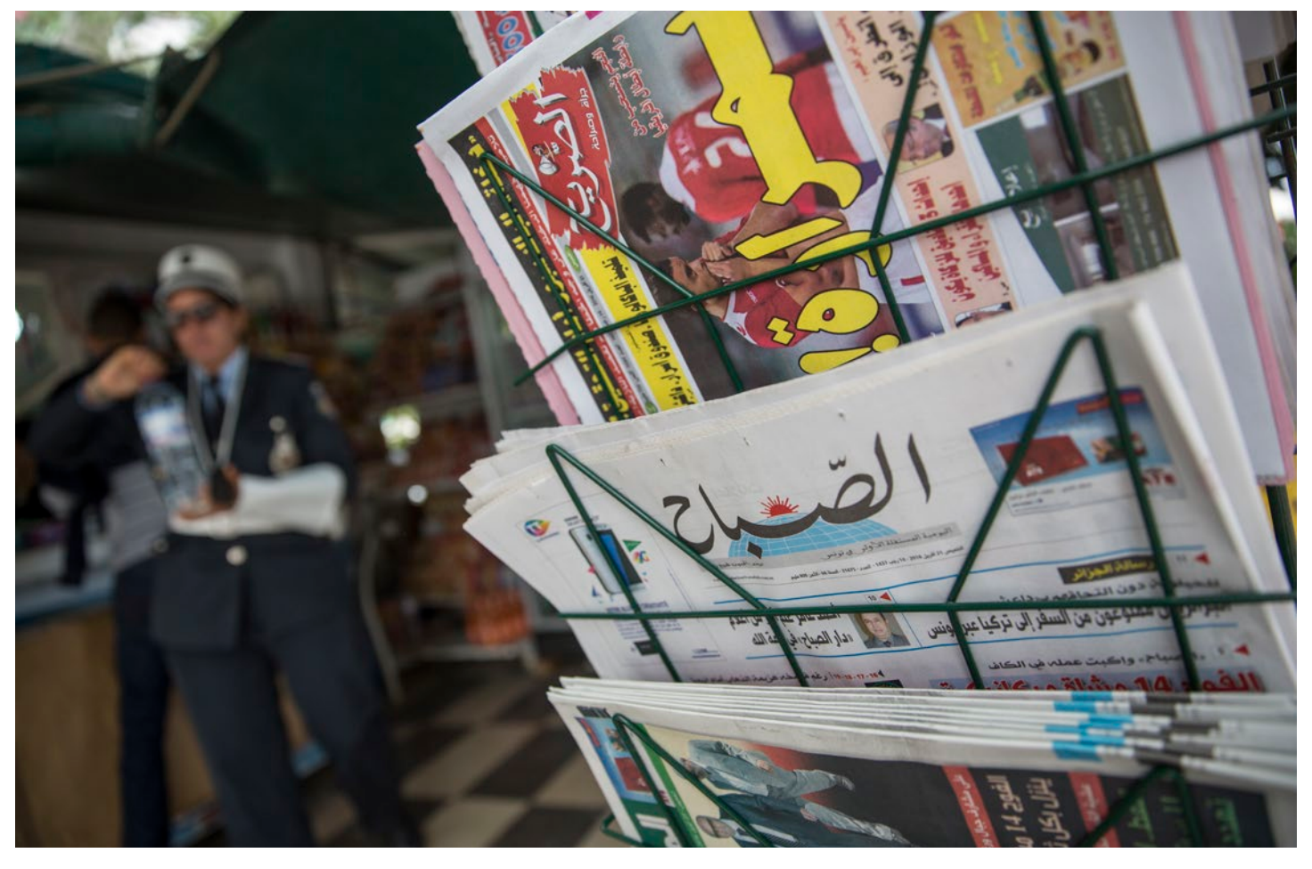
A shop in Tunisia