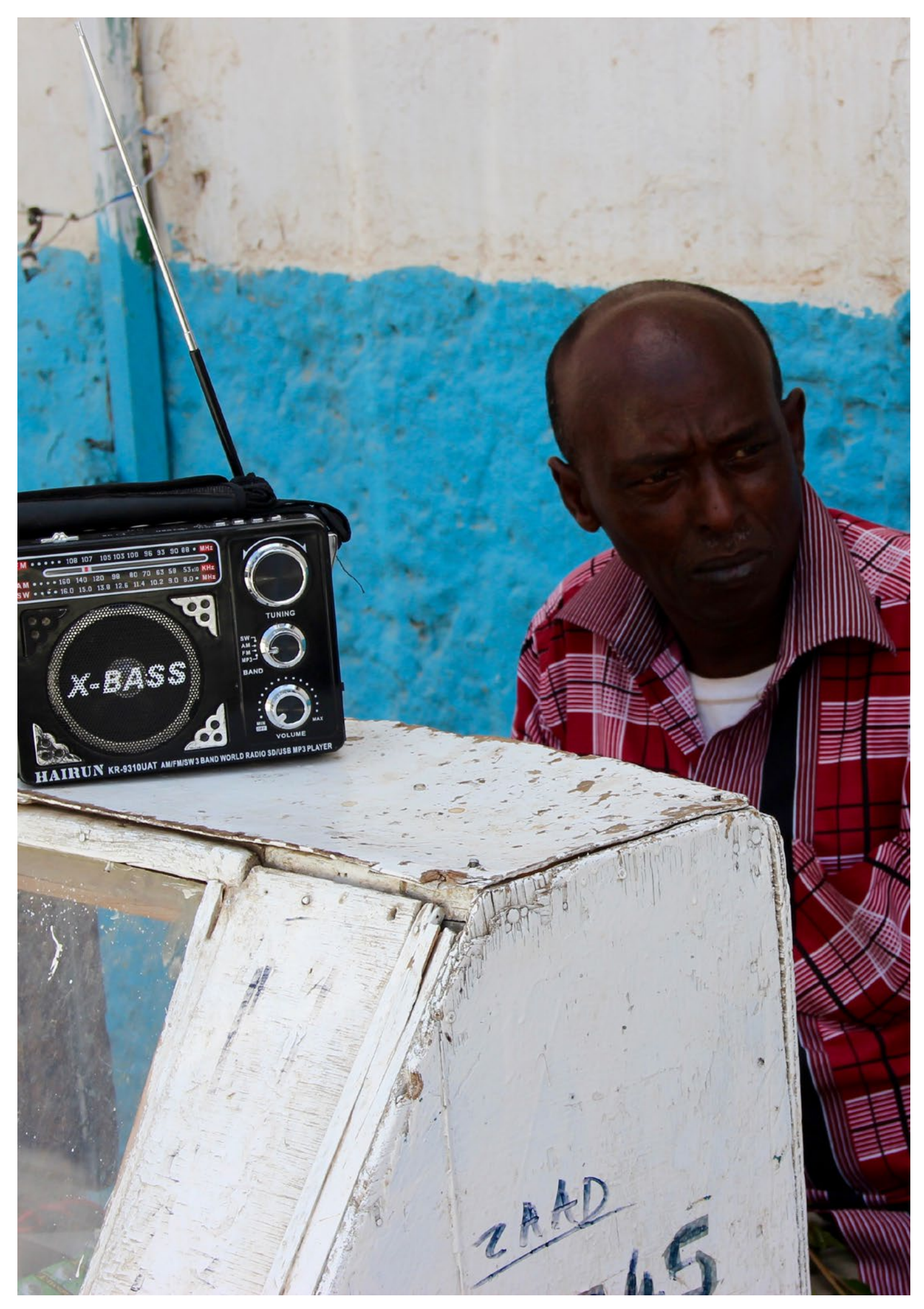
Street vendor in downtown Hargeisa listening to Somallands News Report