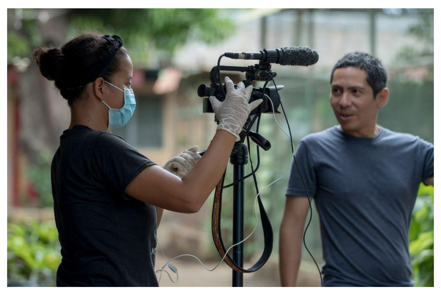
Journalists working during COVID-19 in El Salvador