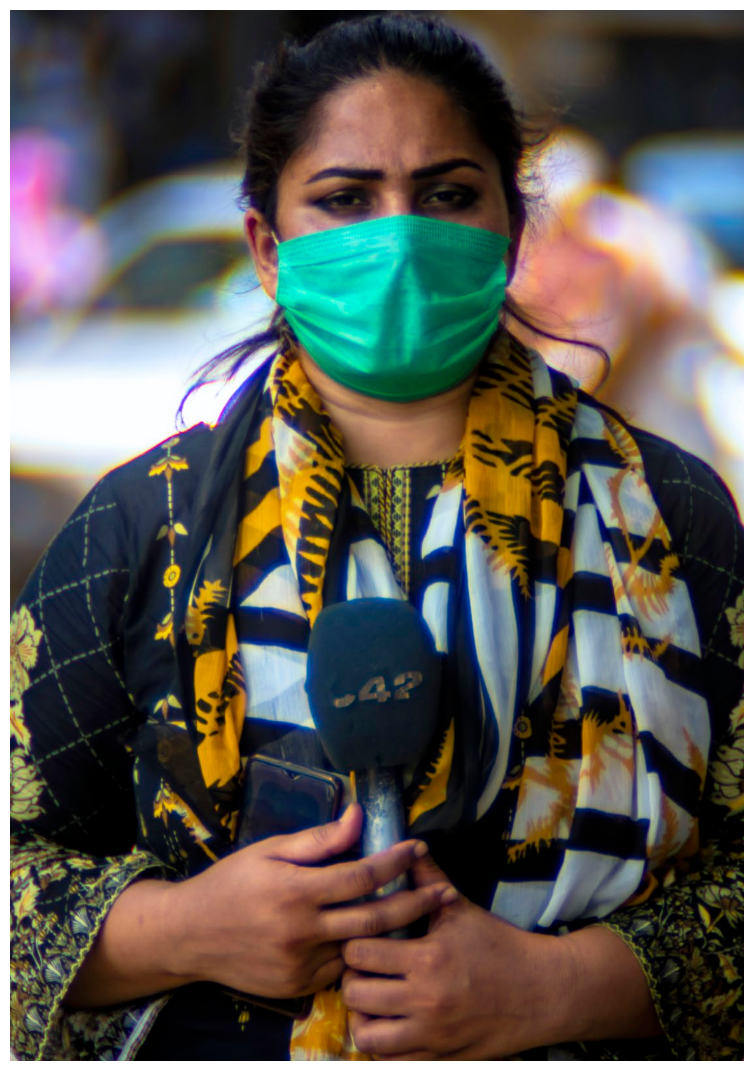
\hbox{$@$ Free Press Unlimited/Digital Rights Foundation: Journalism in Pakistan during Covid-19}\\