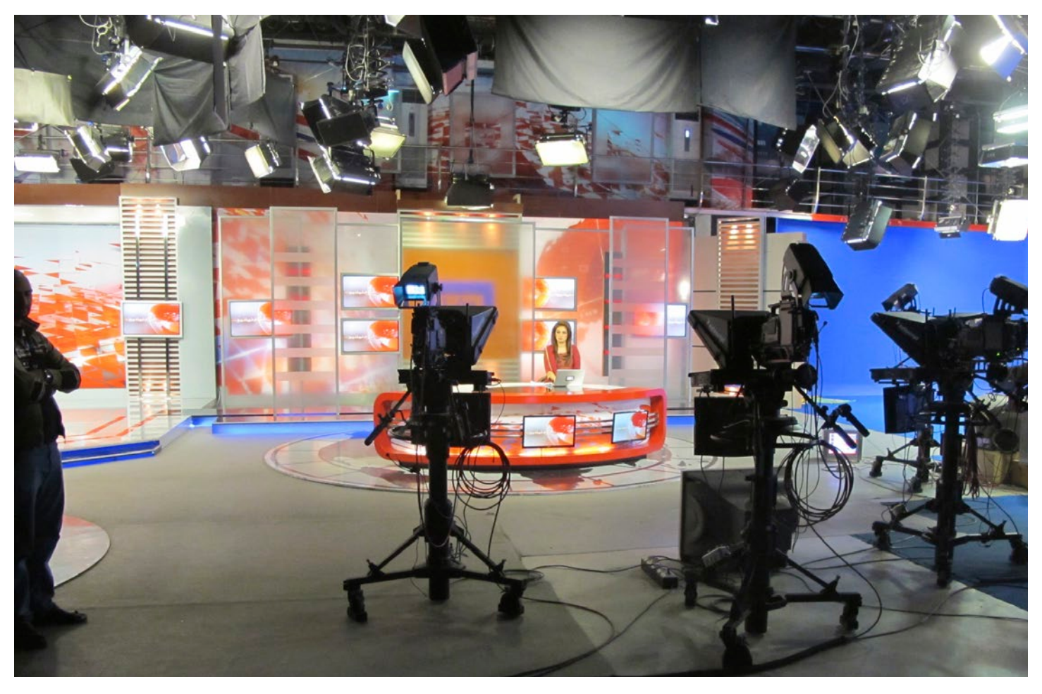
© Ian MacWilliam - Free Press Unlimited: TV studio in Pakistan