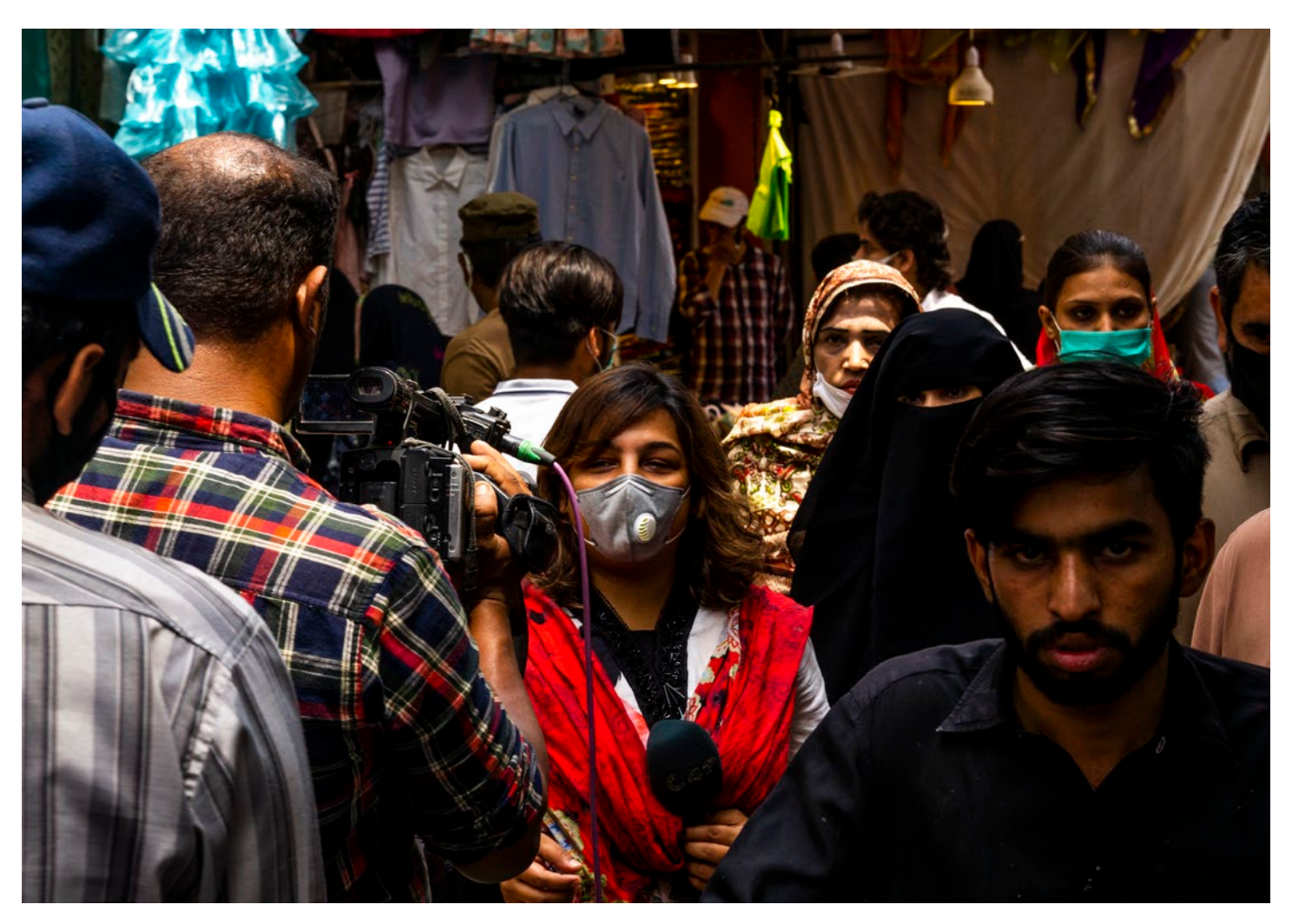
© Free Press Unlimited/Digital Rights Foundation: Journalism in Pakistan during Covid-19