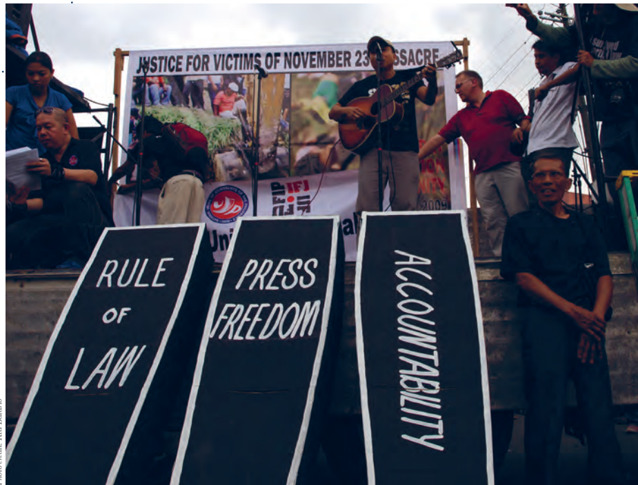
Anti impunity campaign

While safety training can be effective, it isn’t enough, Batario says, especially in a climate where respect for human rights is being disparaged. “It makes the culture of impunity even more pronounced, and I think that is the situation we are all faced with, that we are trying to address on many fronts.”