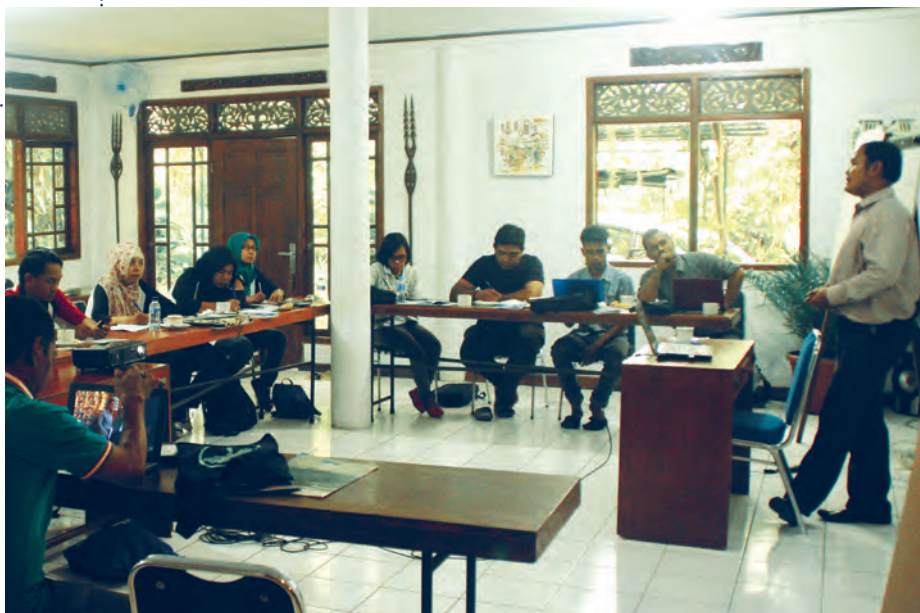
The Indonesia Association for Media Development is dedicated to building their capacity and ensuring they work safely.

The organization is associated with a regional news agency called Asia Calling, which produces radio reports and other content for hundreds of radio stations in Indonesia and around southeast Asia, largely from part-time stringers employed by other news organizations.