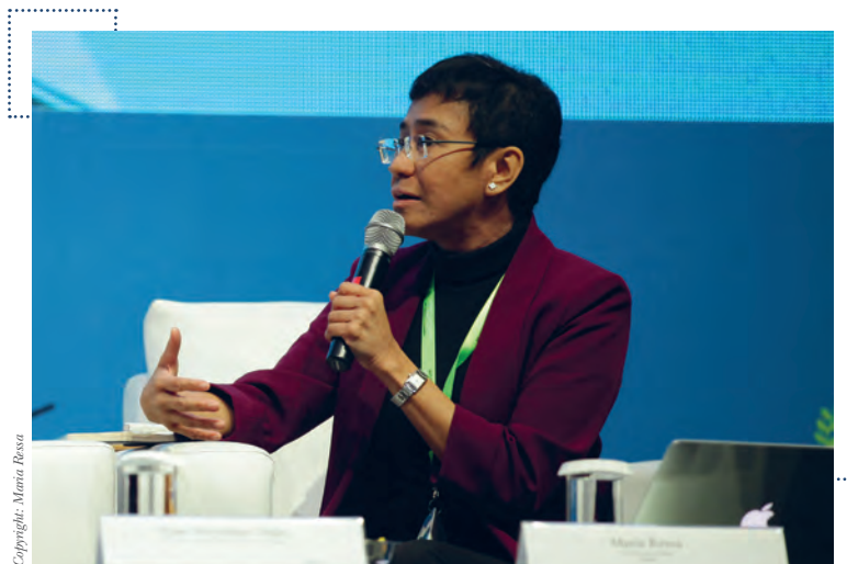
Maria Ressa speaks at UNESCO's World Press Freedom Day conference in Jakarta, 2017

In addition to being threatened with rape and murder, she's been the subject of hashtag campaigns like #ArrestMariaRessa and #BringHerToTheSenate, designed to whip up online mobs into attack mode, discredit both Ressa and Rappler, and chill their reporting.