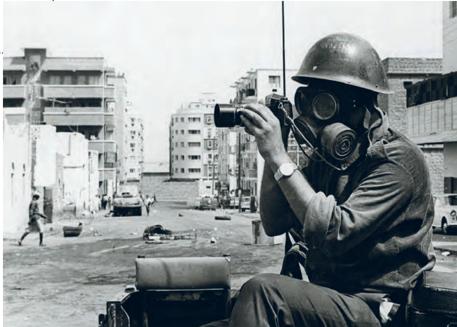
Mo Amin in a gas mask covering the war in Aden, Yemen, in the 1970s.

to the organizations that because of budget cuts no longer have permanent presences in all of these countries. People talk, and word will spread if they treat their freelancers badly, or if they don't treat them as well as another organization, and people will leave them. It's not anything they've done out of the goodness of their hearts, I think that most organizations have been forced to do it, in order to keep the best personnel."